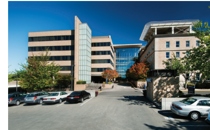
Legacy Emanuel Medical Center