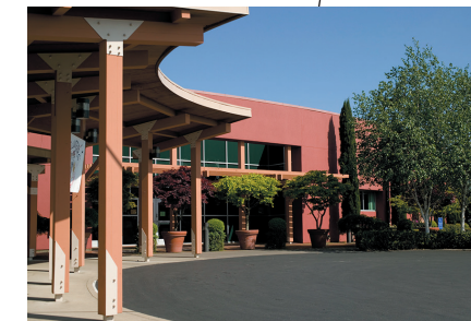
Legacy Silverton Medical Center