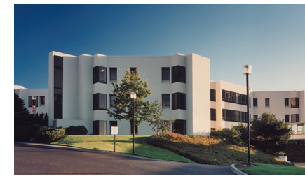
Legacy Meridian Park Medical Center