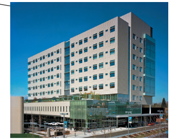
Randall Children's Hospital at Legacy Emanuel