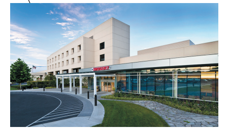
Legacy Mount Hood Medical Center