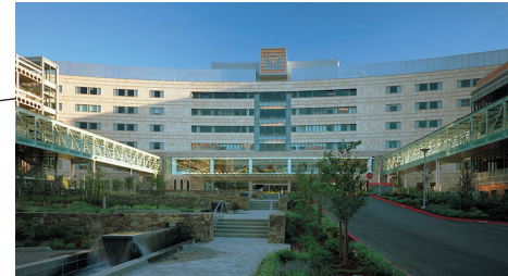
Legacy Salmon Creek Medical Center