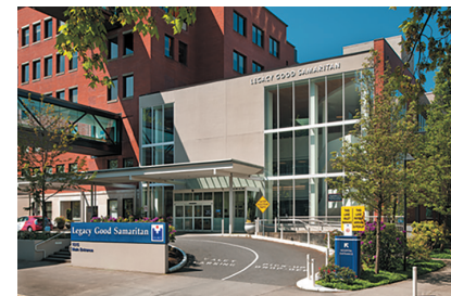
Legacy Good Samaritan Medical Center