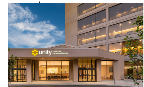
Unity Center for Behavioral Health