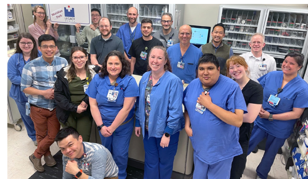
The Legacy Meridian Park pharmacy family

On the first Friday of every month the team celebrates with a special “kudos” time of recognition, which